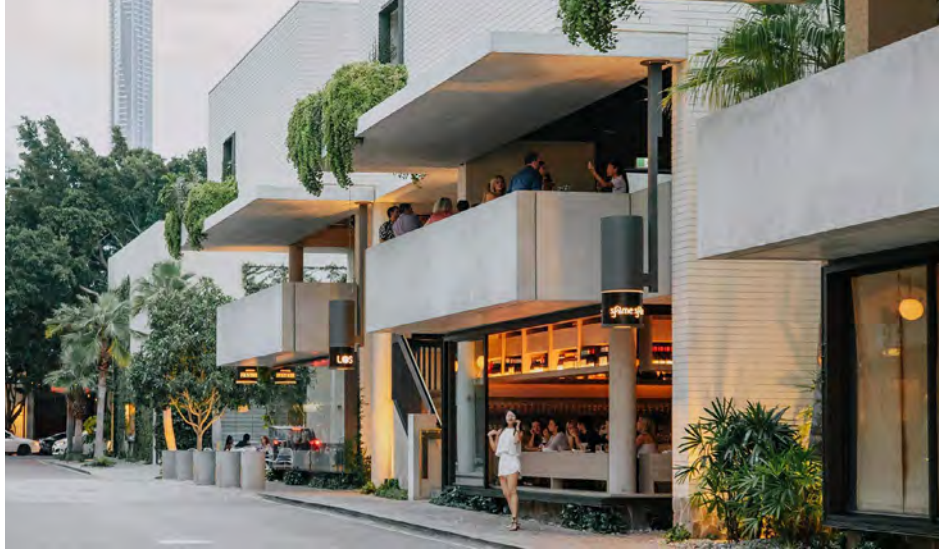
James Street Retail & Dining