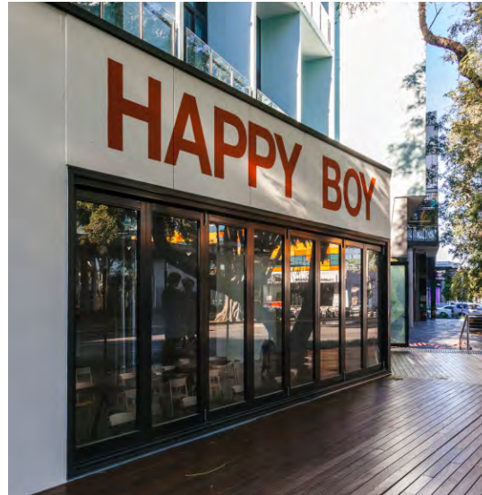
East Street Dining