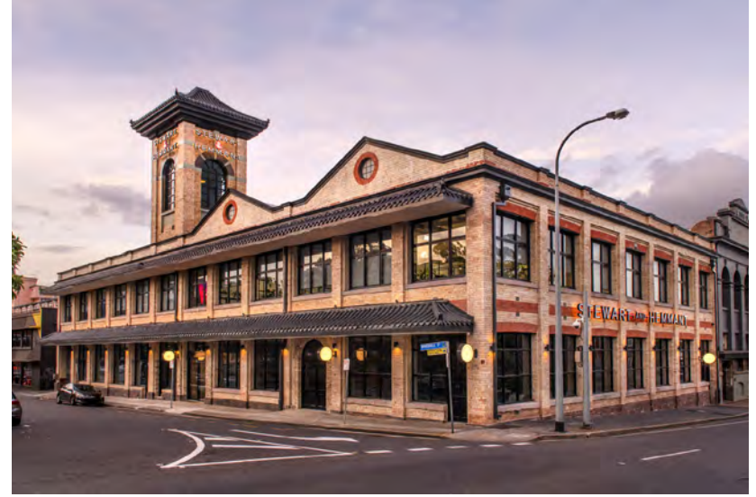
Marshall Street Dining