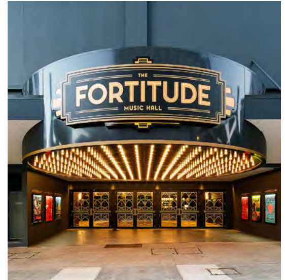
Fortitude Music Hall

Discover Fortitude Valley, where Brisbane comes alive.